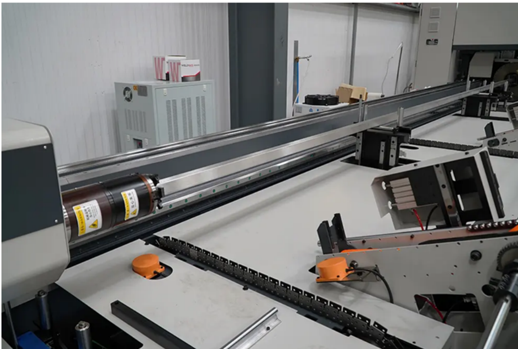
Optional Automatic Loading System