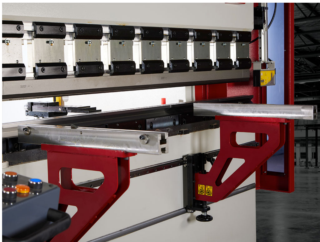
Optional R-Axis Back Gauge with Additional Fingers