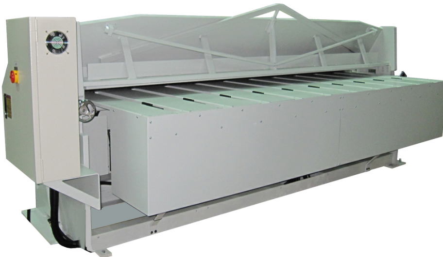
Rear view of HBP model with NC back gauge control