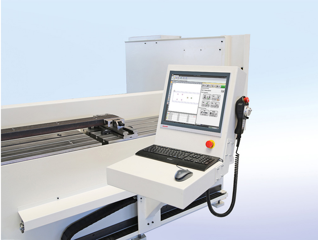
Pictured with optional vice