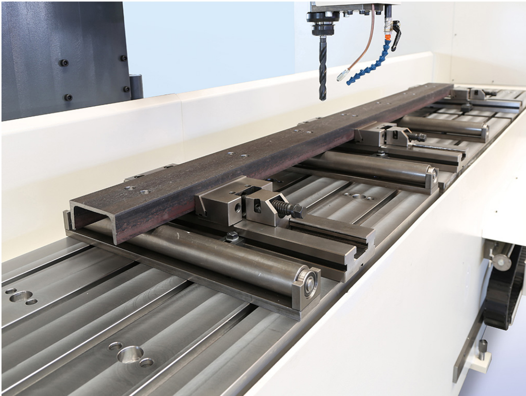
Pictured with optional vices and bed rollers